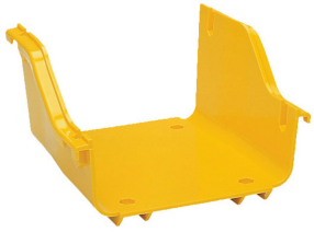
FiberGuide® Straight Reducer, 2x6 to 4x6in, Yellow