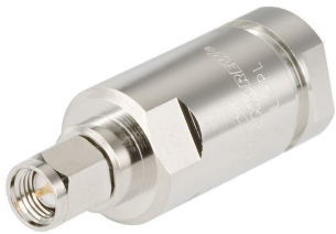
SMA Male Positive Lock for 1/4 in LDF1-50 cable