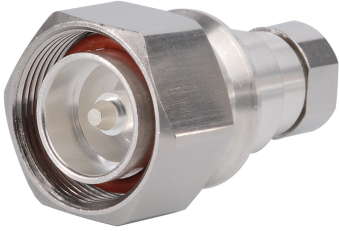
7-16 DIN Male for 3/8 in LDF2-50 cable