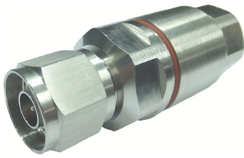
Type N Male Low PIM Positive Stop™ for 1/2 in RCT RADIAX® Radiating cable