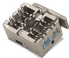
Jack Termination Tool Lacing Fixture (SL / KJ / UNJ)