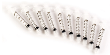
Syringe, 3CC, quantity 10