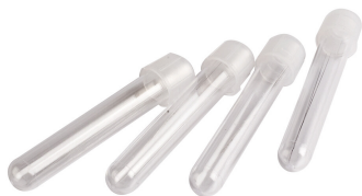
Music Wire, 4 vials+C19