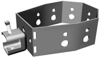
Cluster Support Bracket, u-bolt for 2-3/8 in OD round member attachment