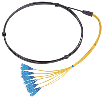
Fiber Optic Cable Assembly, 12 SC/UPC to Stub, 12-fiber, 700 Feet