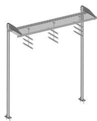
Safety Grated Waveguide Bridge Kit, 24 in x 10 ft, with two 10 ft 6 in base shoe posts