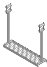
Work Platform for Double Pipe Support Arm