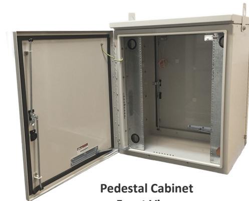
Pedestal Cabinet Front View

The AgileMax cabinet is also available in an MDU configuration, which features top and bottom mounting strips to secure the cabinet in a wall application. The strips allow field technicians to bolt the cabinet in place to an indoor or outdoor load-bearing wall. Like the Pedestal Cabinet, the MDU Cabinet offers mount space for up to 16 1RU 19-inch rack mount devices.