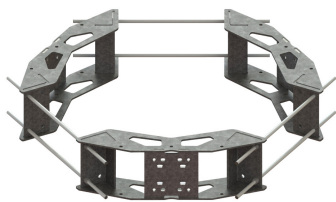
Universal Ring Mount, 30 in to 60 in OD