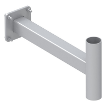
Single Support Arm, 36 in, includes pipe