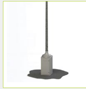
BOTTOM OF THE POLE SOLUTIONS