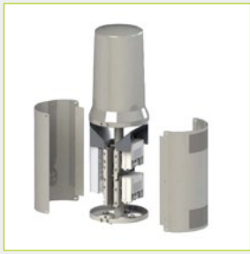
TOP OF THE POLE SOLUTIONS