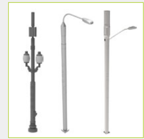
INTEGRATED POLE SOLUTIONS

CommScope offers a full portfolio of Integrated Pole solutions to address each of these challenges, so operators can grow their 5G networks, network engineers can design more efficient infrastructure, and municipalities can provide exceptional connectivity to both mobile users and smart devices without compromising aesthetics in public spaces. Our latest addition to this family is a 20-inch OD integrated pole that offers a multi-tenant option for ultimate flexibility and equipment capacity—including being C-band ready!