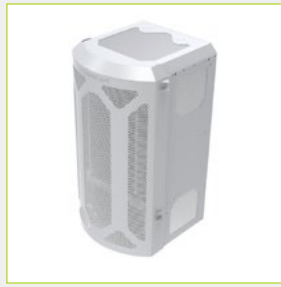
MID POLE SOLUTIONS