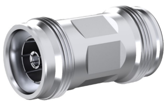
4.3-10 Female to 4.3-10 Female Low-PIM Adapter