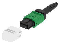
MPO-12, ULTRA LOW LOSS, MALE, Singlemode, GREEN, 2mm