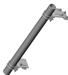
Universal Taper Pipe Mount Slider Bracket, 2-3/8 in OD x 96 in pipe