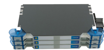
FACT® Fiber Optic Pre-cabled Chassis, gray, 3E high, 144-port, singlemode, loaded with LC/UPC adapters and pre-cabled yellow indoor micro-tube cable, 150 meters