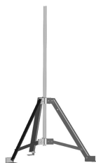
Universal Tripod Mount, base only, pipe not included