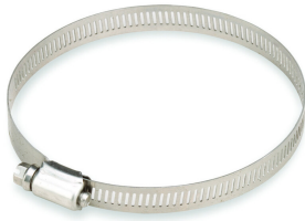
Round Member Adapter for 1–2 in round members