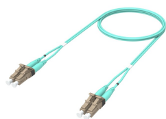
Fiber Optic Patch Cord, Duplex, Multimode, LC/UPC to LC/UPC, LSZH & OFNR, aqua, 4 m