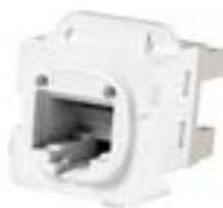
Cat 6 A UTP FMK10G Jack with Bezel