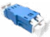
Fiber Optic Duplex Adapter Flangeless