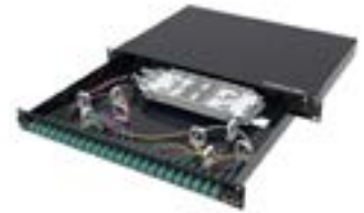
1RU FMS Tray OM4 – (up to 48f in LC)