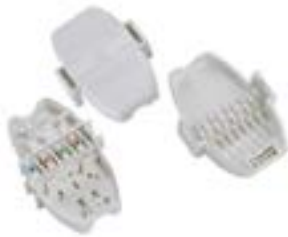
CCA UTP Connector Only