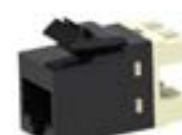
Patch Panel SLX Jack, Black