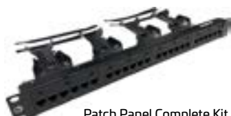
Patch Panel Complete Kit