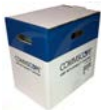
Cat 6 U/UTP Reel in a Box