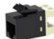
Patch Panel SLX Jack, Black