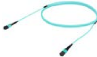
MPO to MPO OM4 Patch Cable