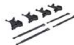
Rear Cable Manager Saddle Kit