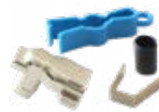
SLX 4 Direction Cable Exit Cap