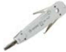
KRONE Connection Tool with Sensor