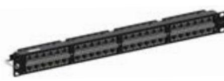
48 port 1RU Loaded Patch Panel