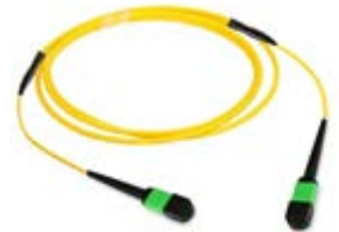
MPO to MPO OS2 Trunk Cable