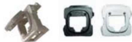
Clipsal/ HPM Bezels for SL Jacks