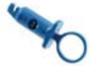
Jacknack Cable Stripping Tool