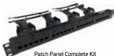
Patch Panel Complete Kit