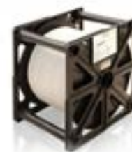
Cat 6 U/UTP REELSPEED