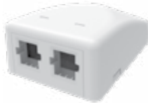
Surface Mount Box, universal, two ports, pro white