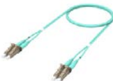
Patch Cord OM4 LC-LC