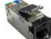
Patch Panel SLX Jack, Black