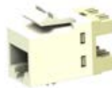
Cat 6 A SL110G without Bezel