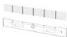
Patch Panel Label Kit