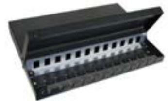
12 Port Consolidation Point for SL Jacks