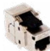
KJX Series Modular Jack, RJ45, Cat6 A Shielded Side Entry, Silver