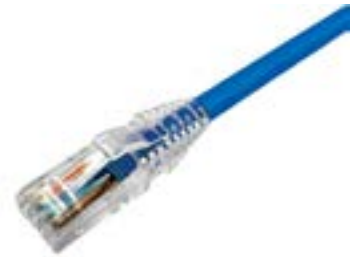
Cat 6 U/UTP Patch Cord