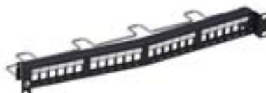
Recessed Angled Unloaded Panel