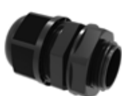
Patch Cable Gland Kit