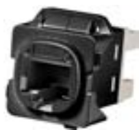
Cat 6 A UTP FMK10G Jack with Shuttered Bezel