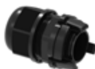
Trunk Cable Gland Kit