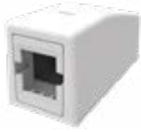
Surface Mount Box, universal, one port, pro white