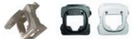
Clipsal/HPM Bezels for SL Jacks