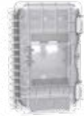
Surface Mount Box, universal, two ports, pro white