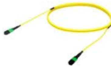
MPO to MPO OS2 Patch Cable