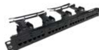
Patch Panel Complete Kit