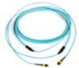
MPO to MPO OM4 Trunk Cable