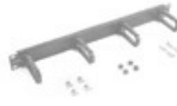
IRU 4 Ring Metal Patch Cord Minder