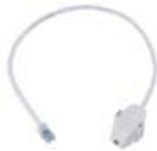
CCA Connector with Cat 6/ Cat 6 A cable assembly