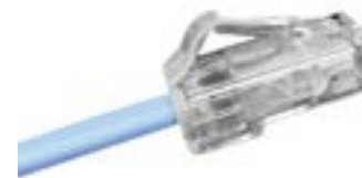
Cat 6A U/UTP Mini Patch Cord