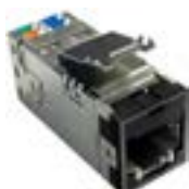
Cat 6 A SLX Shielded Jack Black