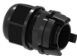
Trunk Cable Gland Kit