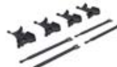
Rear Cable Manager Saddle Kit