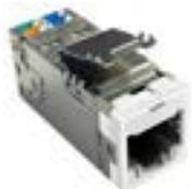
Cat 6 A SLX Shielded Jack Alpine White