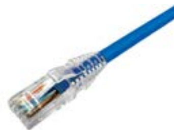
Cat 6A U/UTP Patch Cord