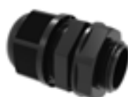
Patch Cable Gland Kit