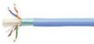
Cat 6A F/UTP - Blue