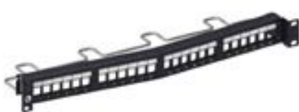
Recessed Angled Unloaded Panel