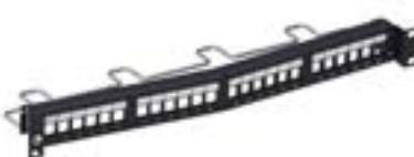
Recessed Angled Unloaded Panel