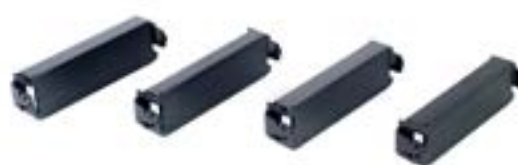
G2 Panel Blank Adaptor (4 pack)