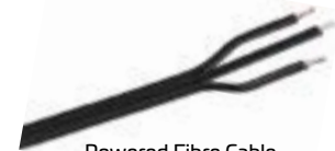
Powered Fibre Cable