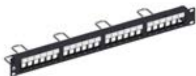
Patch Panel Complete Kit