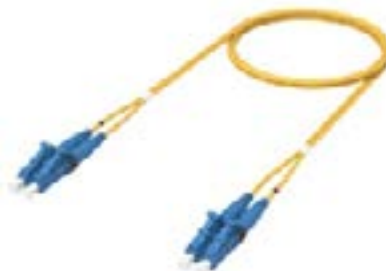
Patch Cord OS2 LC LC