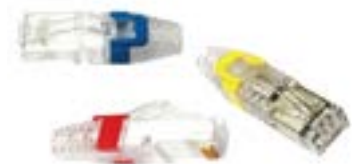
Modular Coloured Clips