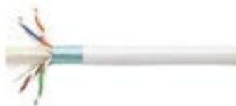
Cat 6A F/UTP - White