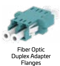
Fiber Optic Duplex Adapter Flanges