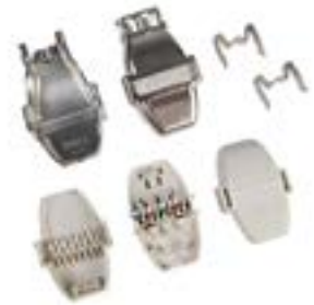
CCA Shielded Connector Only