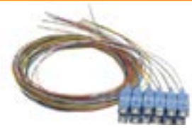
Pigtail 1.5 metre Pack of 12