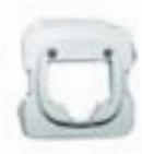
Clipsal/HPM Bezels for SL Jacks