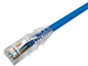
Cat 6A Shielded Patch Cord