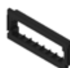
Quick-Fit to G2 Adaptor