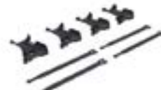
Rear Cable Manager Saddle Kit