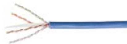
Cat 6 A U/UTP Cable