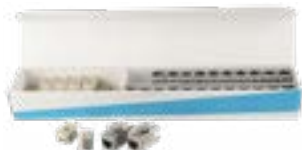
Cat 6 A RJ45 SLX Shielded Jack Black – Bulk Pack (pack of 24)