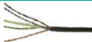
Cat 6A F/UTP - External/ Underground