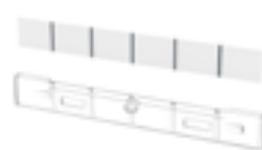
Patch Panel Label Kit