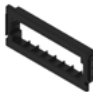
Quick-Fit to G2 Adaptor