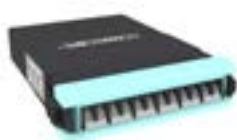
MPO-12 OM4, 1x12f MPO port