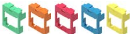
Coloured Nose Caps for SLX Jacks