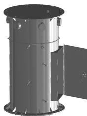
Stackable Pod Mount Extension, 12 in