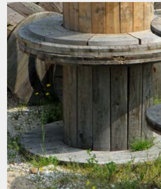
Discolored wood that is undamaged is acceptable.