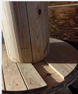
Do not return a cable reel with a damaged flange.