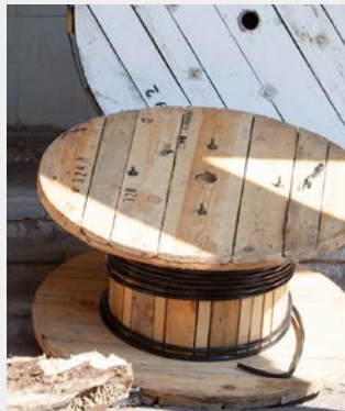
Do not return a reel with cable tails or cable left on the drum.