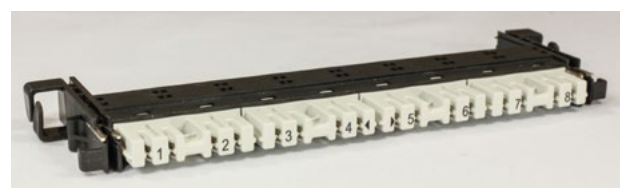
HDS-7042 2 400-00 - Cable Side Module (base)

For more technical options and order quantity information, please consult the product ordering guide or your local sales representative.