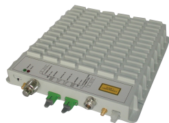
ION®-B Series Medium Power Remote Unit for EGSM 900 and UMTS