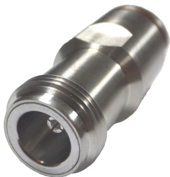
Type N Female for CNT-400 braided cable