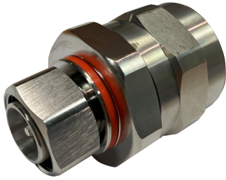
4.3-10 Male EZfit® Connector for 7/8 in AVA5-50 and AVA5-50FX cable