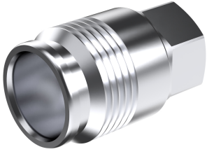
2.2-5 Male End Cap Assembly